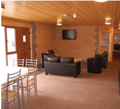
En-Suite Chalets - Downstairs